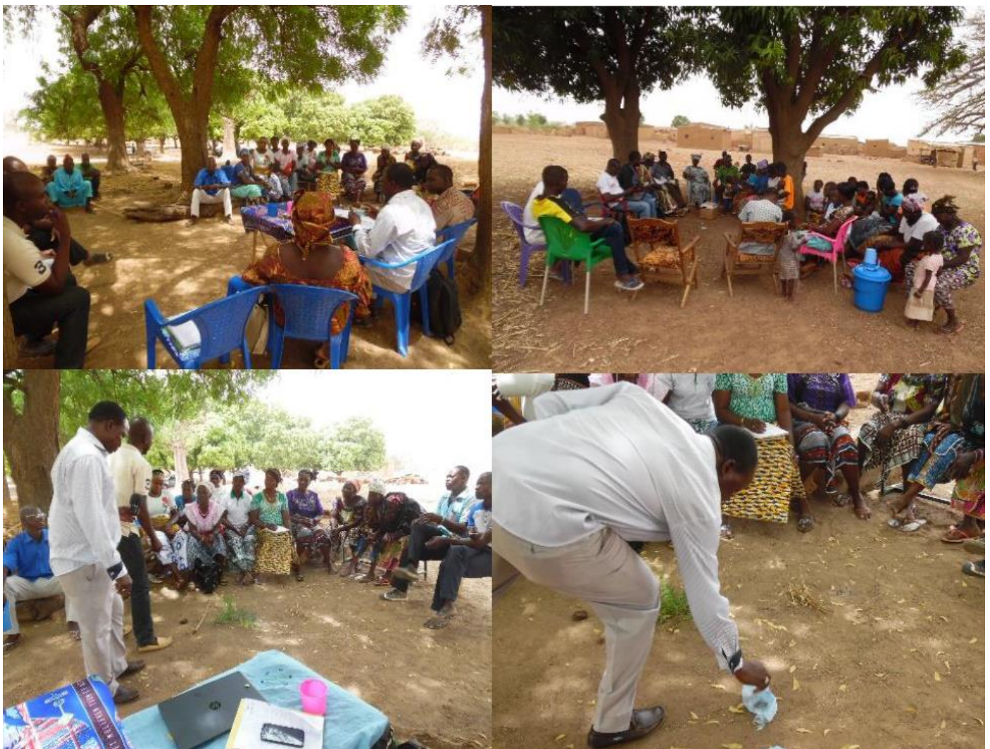
Fig. 3. First radio listening programme meetings in Poa and Tomo, April 2018.