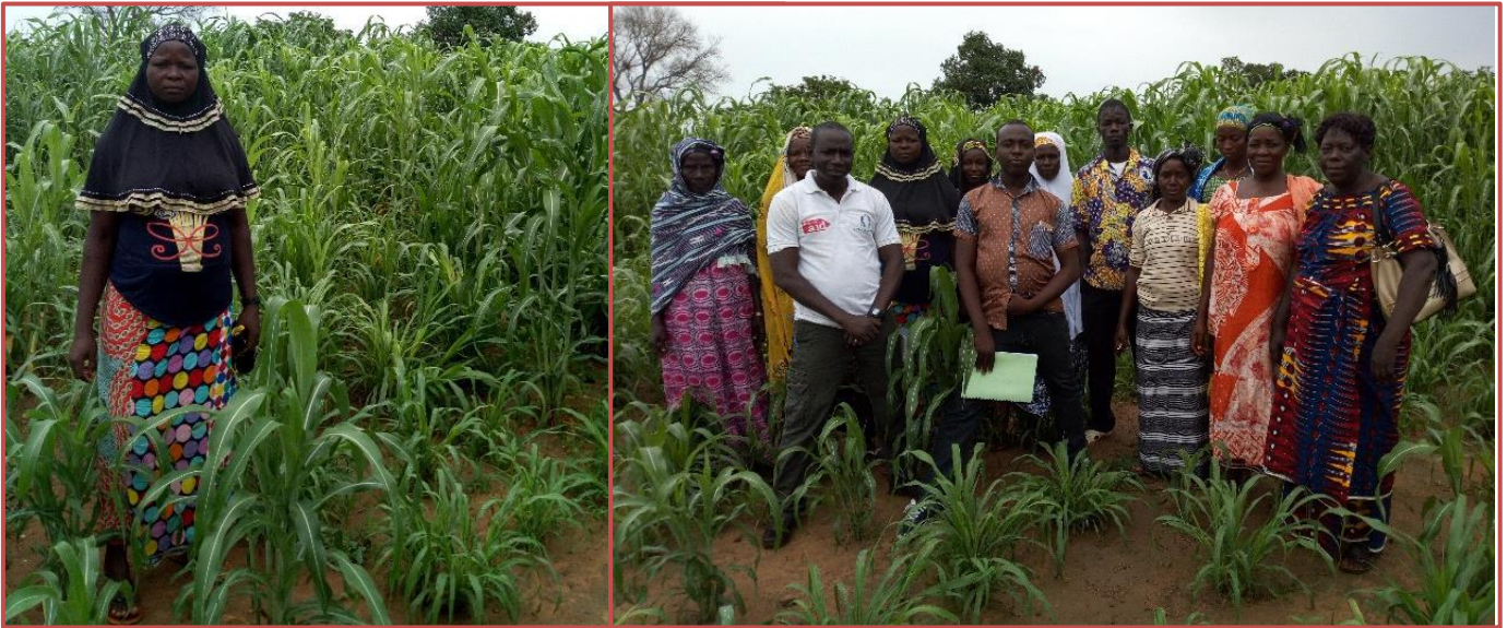
Fig. 4. Sorghum farm of radio listening group participants from Poa. Short crops in the foreground are those without the RLP practices applied.

A mid-way review was conducted in August 2018 by Réseau Marp and IRC. A reflective diary form provided by the Walker Institute was utilized. This matches with the user guide for radio learning groups which were also provided by the Walker Institute. IRC translated these materials into French for accessibility. This was appreciated by members of the programme who considered the RLP a key factor in the newfound success of their agricultural projects (see Fig. 4.)