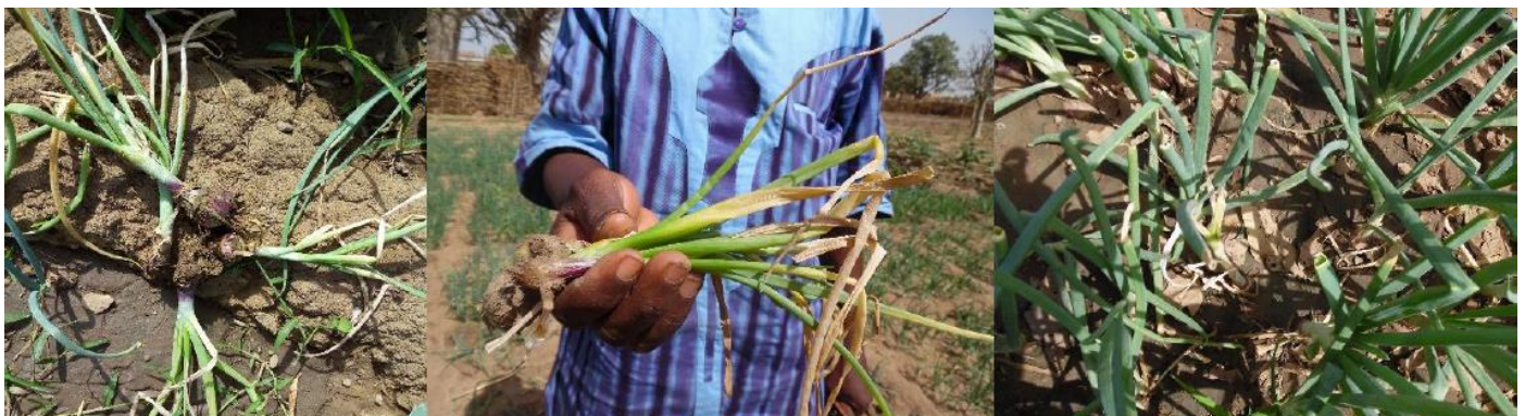
Fig. 5. Pest attack on onions: Poa (Left), Tomo (Middle and Right).

It was observed in the gardens of both Poa and Tomo that onions were damaged by pests in 2018 (see Fig. 5). This occurred during the first growth period of onions (August). This left onions yellow with either no bulb at all or a minor bulb. Many gardeners stated this was the first year they witnessed this adverse effect.